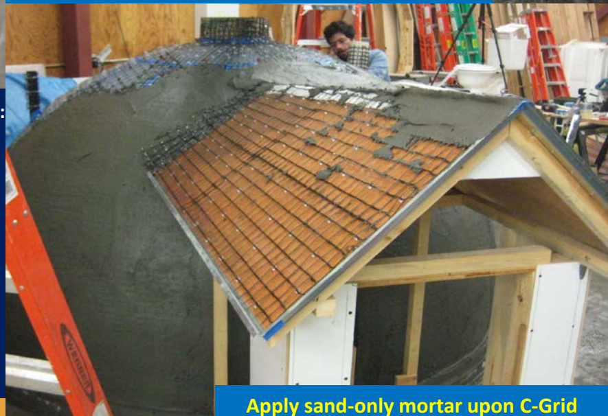
Apply sand-only mortar upon C-Grid