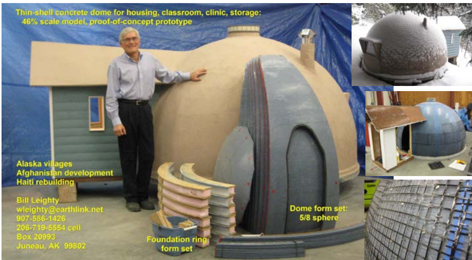
Scale model, proof-of-concept prototype: 3 m inside diameter; 1 cm thick, non-ferrous

Humanity will need billions of these durable, noncombustible, low-cost, low-Earth-impact, Earth-shelterable, thin-shell (~1-2 cm thick), non-ferrous-reinforced homes and other small buildings to protect us from deadly heat, storm, fire, flood, earthslide, and even seismic dangers from rapid global warming. Millions of us will migrate, retreating underground among our sister species, to safety. This on-site manufacturing plan should deliver a completed "house" per week, per three-person crew; an enclosed, insulated envelope per week, saving lives. We now need $ 600 K outside investment to scale-up forms sets to human-useful size (~ 6-7 m diam), to prove markets, to proliferate flexible-length house-school-clinic shelters. More engineering and test earns several markets' acceptance for building permits, financing, insurance -- for private sector, military, UN human ty deployments. Profitable biz plans: construction forms sale, rental, or franchise, via training and specialized materials supply; we're now ahead of the growth curve for robust, low-cost structures of minimum embodied and O&M energy; go now.